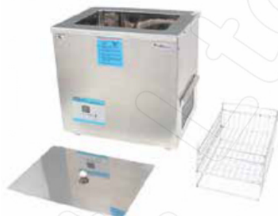
9 Liters MODEL : USB 9L