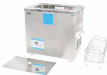
6.5 Liters MODEL : USB 6.5 L