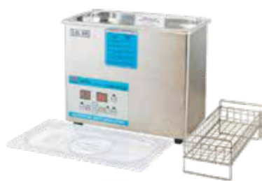
3.5 Liters MODEL : USB 3.5 L