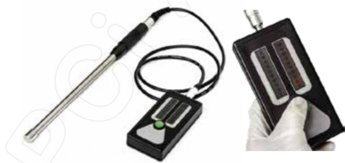
MODEL : Hygea

Ultrasonic performance meter provides a fast, effective & simple to use method of measuring the ultrasonic activity generated in ultrasonic baths. It is used to give a comparative measurement of one a bath's performance over a period of time.