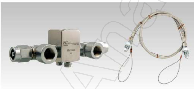
Manual Manifold & Hose