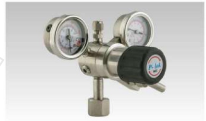
Single Stage for Corrosive Gases TXC Series