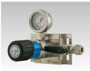
With Outlet Pressure Gauge Regulator & Ball Valve