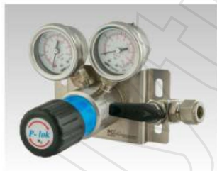
With Inlet & Outlet Pressure Gauge Regulator & Ball Valve