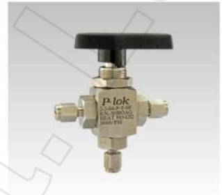
Three Way Valve