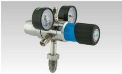
Double Stage Cylinder Regulator NGS Series