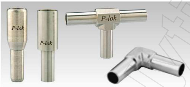
Orbital Weld Fittings