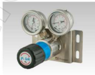
With Outlet Pressure Gauge Regulator