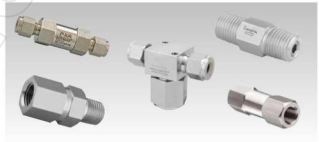
Micron Filter / Check Valve