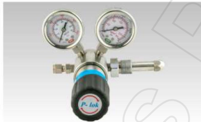
Piston Type Cylinder Regulator FBG Series