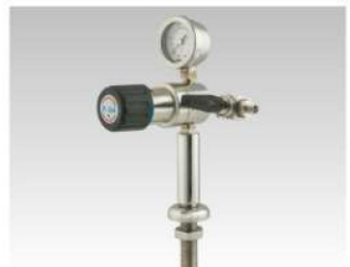
With Outlet Pressure Gauge Regulator & Ball Valve