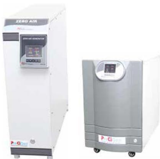
Model : ZAG-02/03