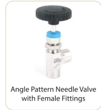
Angle Pattern Needle Valve with Female Fittings