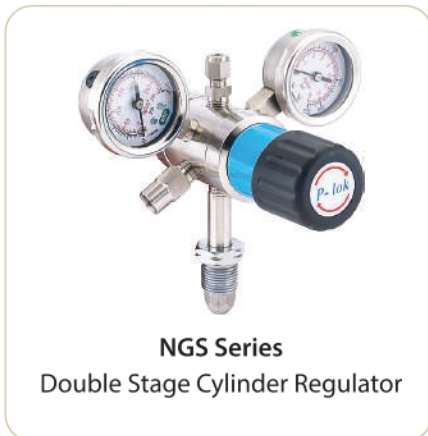
NGS Series Double Stage Cylinder Regulator