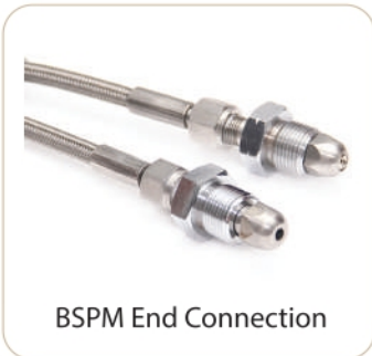
BSPM End Connection