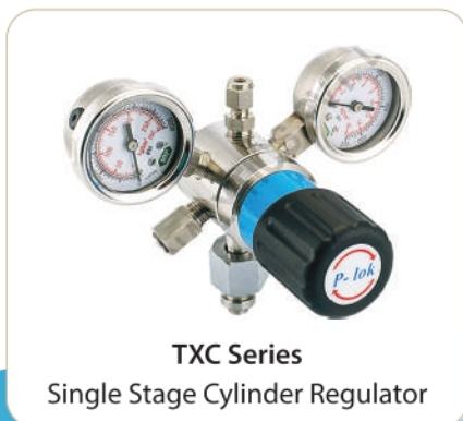
TXC Series Single Stage Cylinder Regulator