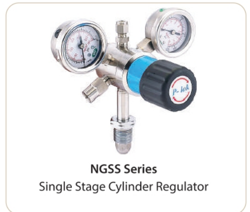
NGSS Series Single Stage Cylinder Regulator