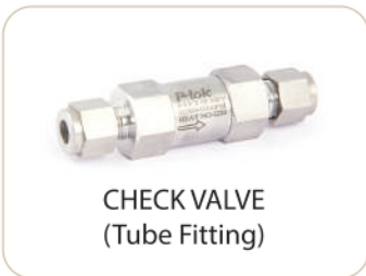
CHECK VALVE (Tube Fitting)