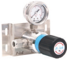
Regulator with Outlet Pressure Gauge