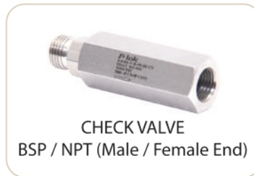
CHECK VALVE BSP / NPT (Male / Female End)