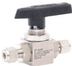
Ball Valve with Tube Fittings