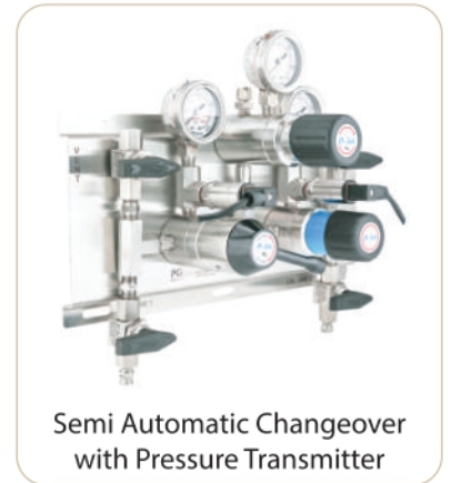
Semi Automatic Changeover with Pressure Transmitter