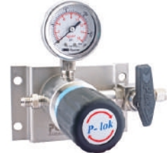
Regulator with Outlet Pressure Gauge & Ball Valve