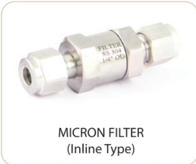
MICRON FILTER (Inline Type)