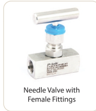
Needle Valve with Female Fittings