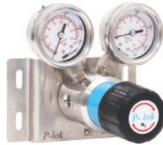
Regulator with Inlet & Outlet Pressure Gauge