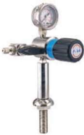
Regulator with Outlet Pressure Gauge & Ball Valve