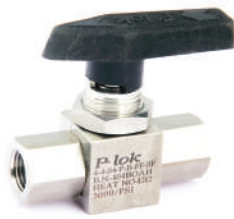
Ball Valve with Female Fittings