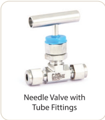
Needle Valve with Tube Fittings