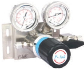
Regulator with Inlet & Outlet Pressure Gauge & Ball Valve