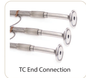
TC End Connection