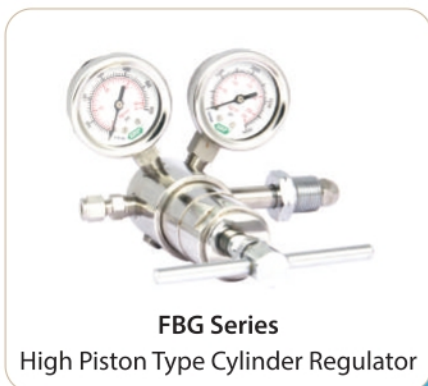
FBG Series High Piston Type Cylinder Regulator