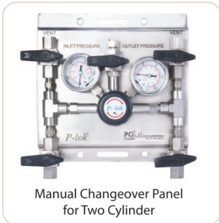
Manual Changeover Panel for Two Cylinder