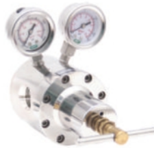
Regulator with Inlet & Outlet Pressure Gauge