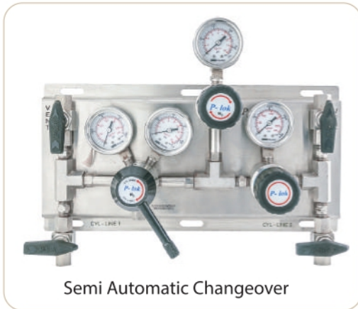
Semi Automatic Changeover