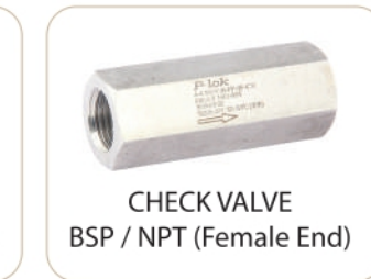
CHECK VALVE BSP / NPT (Female End)