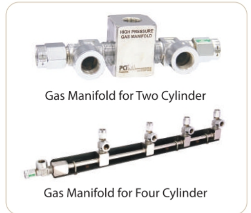
Gas Manifold for Two Cylinder