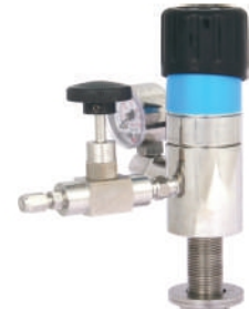
Regulator with Outlet Pressure Gauge, Needle Valve