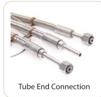
Tube End Connection