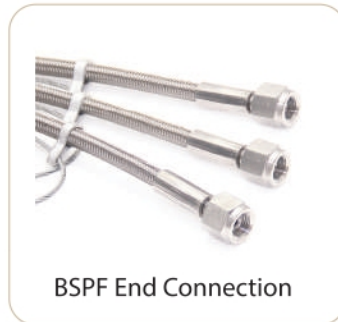
BSPF End Connection