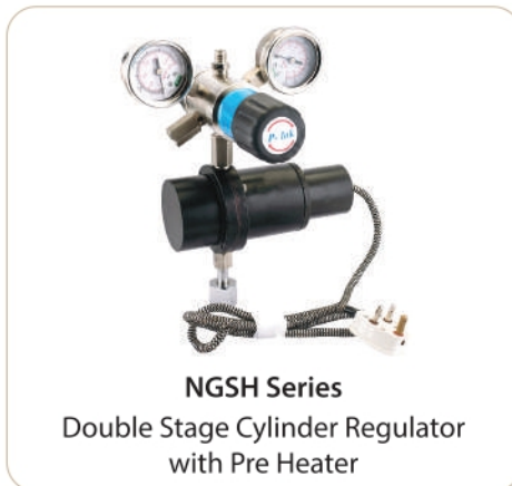
NGSH Series Double Stage Cylinder Regulator with Pre Heater