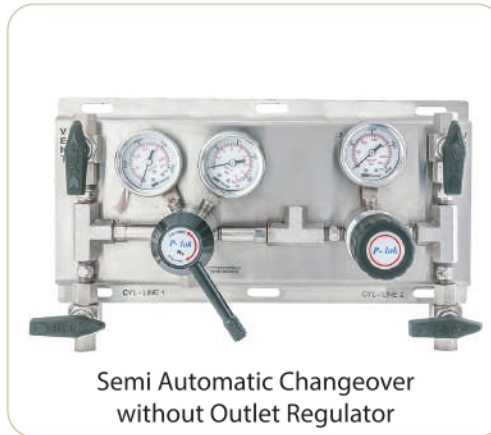
Semi Automatic Changeover without Outlet Regulator