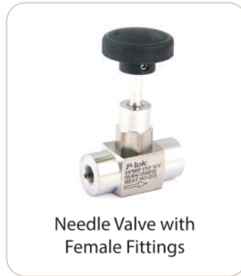
Needle Valve with Female Fittings