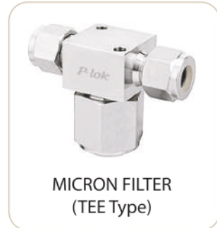
MICRON FILTER (TEE Type)