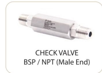
CHECK VALVE BSP / NPT (Male End)