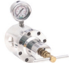
Regulator with Outlet Pressure Gauge