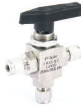
Three Way Ball Valve with Tube Fittings