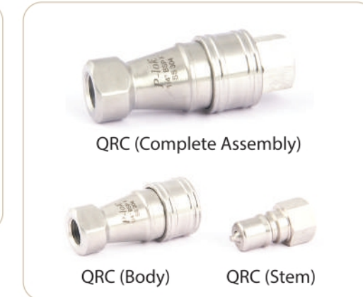
QRC (Complete Assembly)