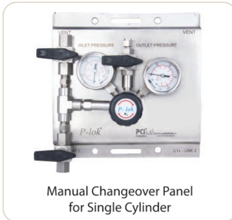
Manual Changeover Panel for Single Cylinder