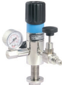
Regulator with Outlet Pressure Gauge, Needle Valve & Shut Off Valve