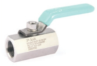
Ball Valve with Female Fittings